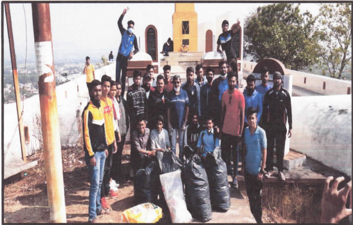
Students collected Garbage in bags after cleaning