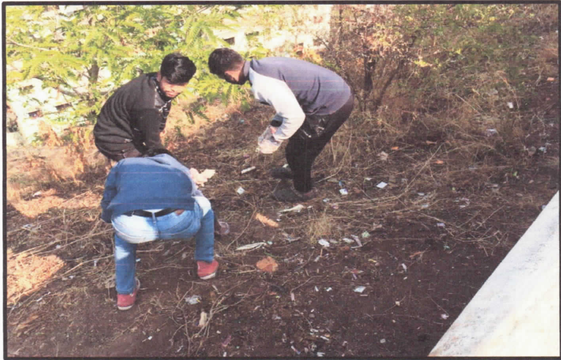
Participants work efforts in cleaning at Historic Char Bhinti premises