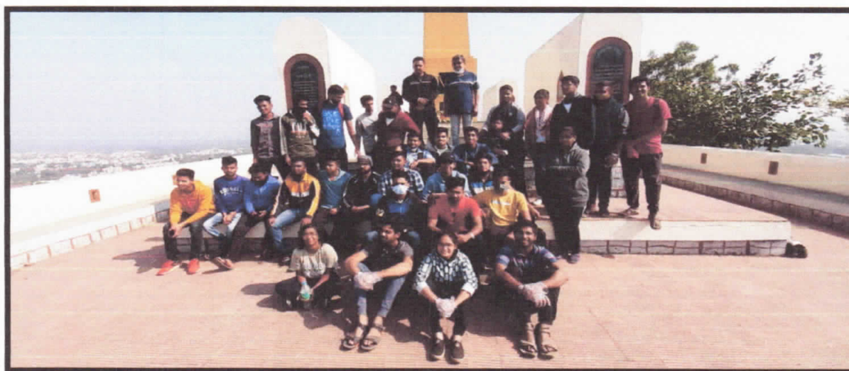
Group of Participated students in Cleanliness activity at Historic Char Bhinti premises