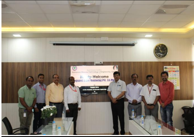
9. Integrated Active Monitoring Pvt. Ltd., Pune