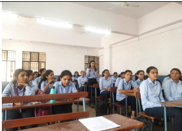
3. Session “Career Opportunities in IT Industries & How to prepare for it” For B.Tech.-CSE Students