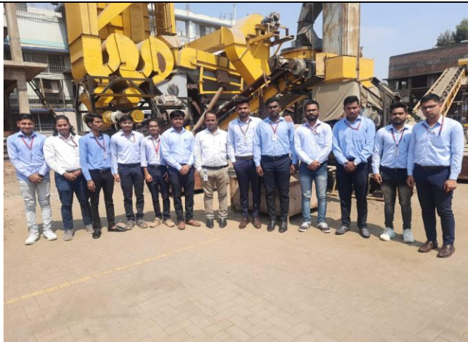
11. Off Campus Drive by Akashganga, Satara