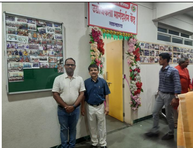
13.Visit to Employabiliy Awareness Centre, Satara