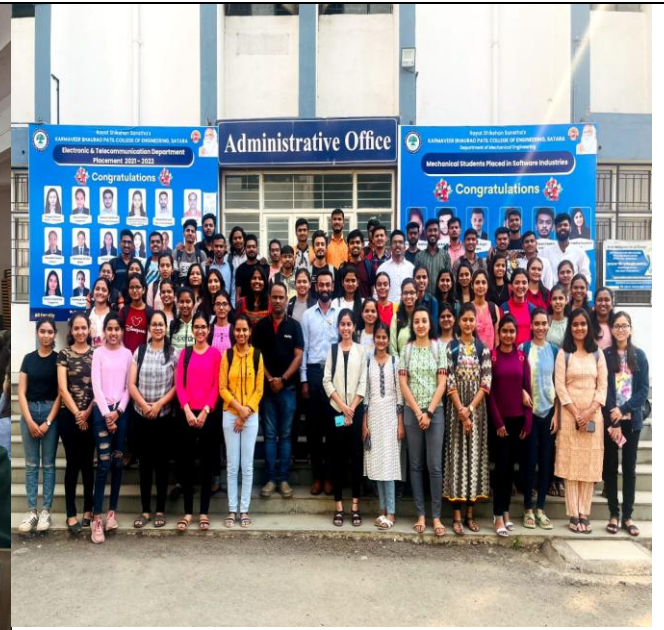
20. One day workshop on Resume writing, personality development and GD