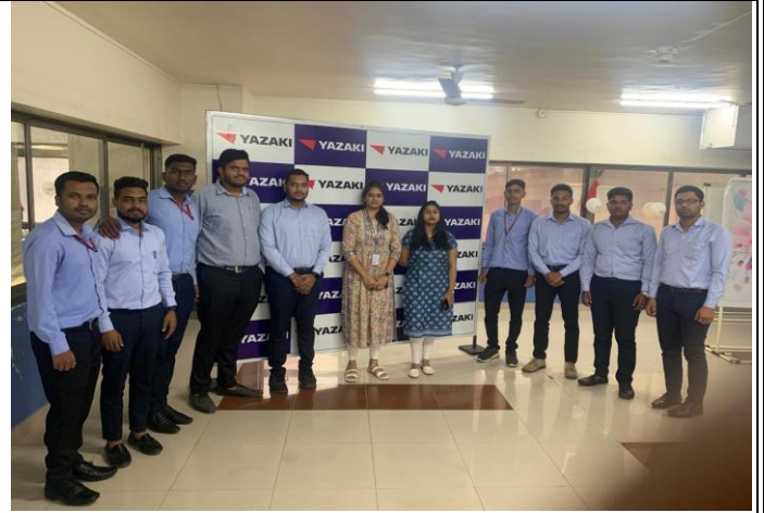
10. Off Campus Drive by Yazaki Inida Pvt.Ltd.,