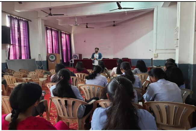
4. Just a Minute (JAM) activity conducted for T.Y.-CSE-Students