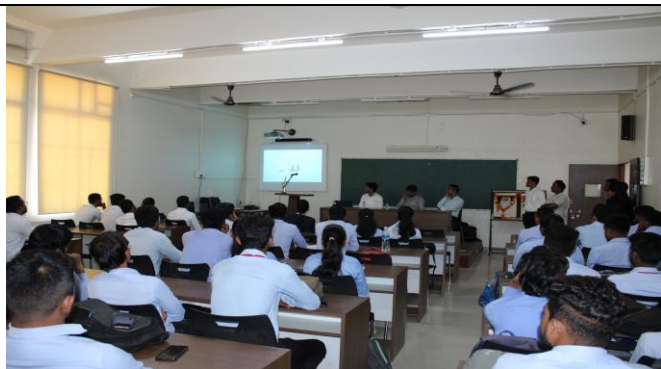
1. Campus Drive by Alfa Laval