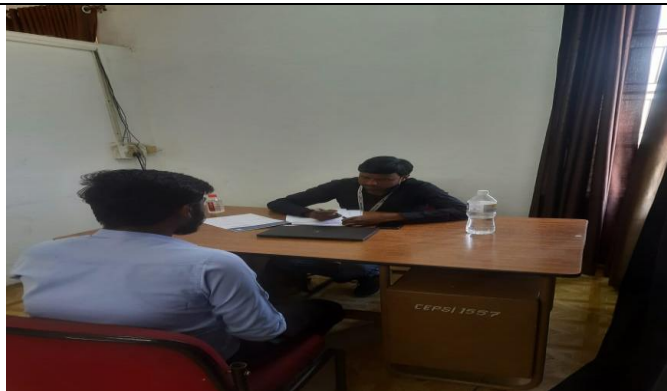
8. Campus Drive by Aerial Mappers,Pune