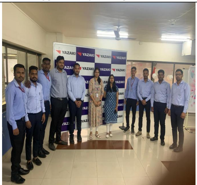
22. Visit to Yazaki India Pvt.Ltd., Pune For mechanical engineering students