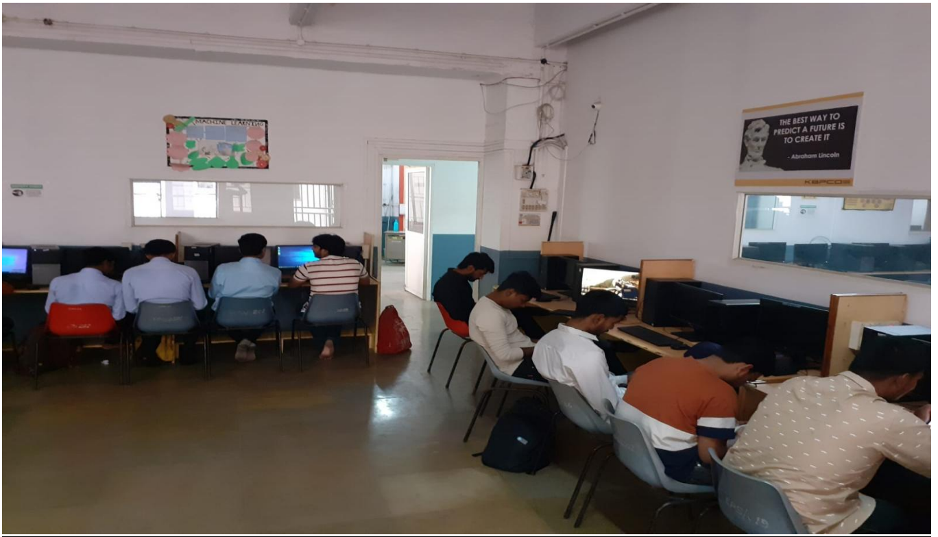
11. Infosys Company Specific Training For T.Y.-CSE & E&TC Engineering studnets by LeadSoft IT Solutions, Osmanabad from 24.03.2023 to 15 Day's