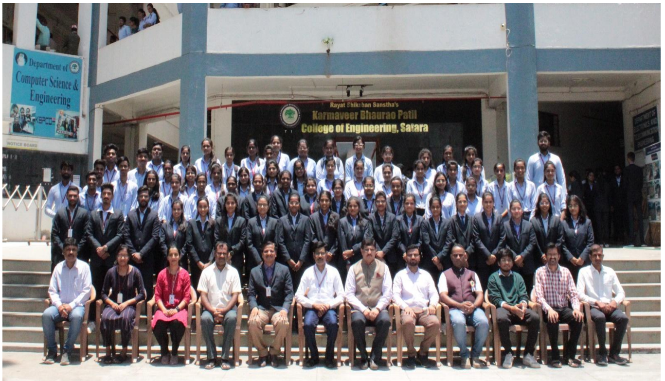
12. AI/ML & RPA Training For B.Tech.-CSE & E&TC Engineering studnets by Symbiosis Consultancy Services, Pune from 03.04.2023 to 3.5 Month's