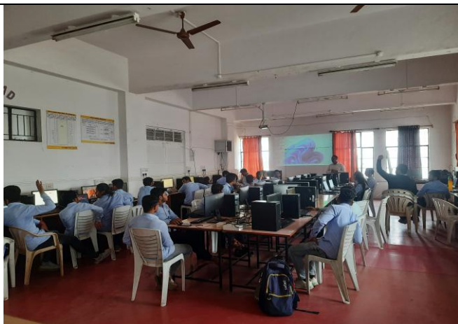
11. Session on “How to prepare for Core companies