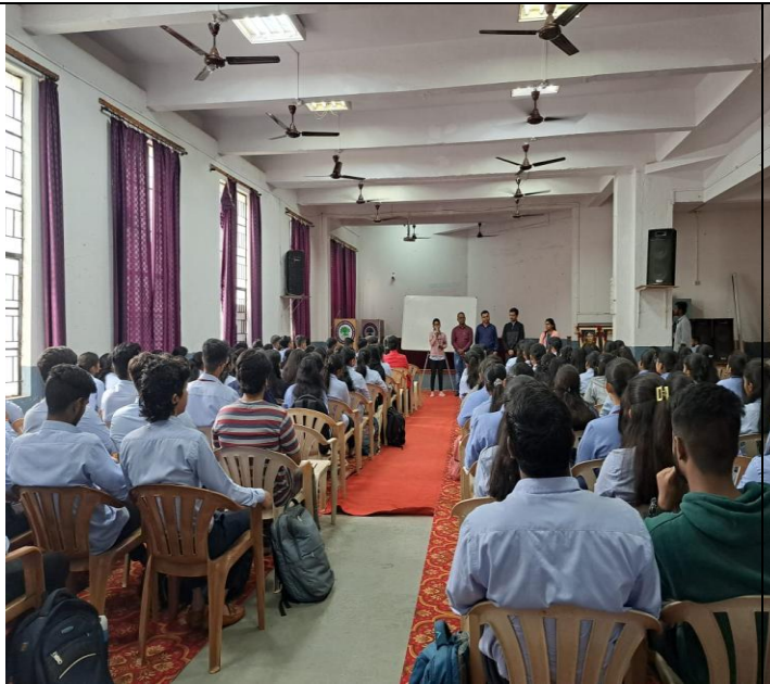
19. Session on "Importance of Aptitude Skills" in placement