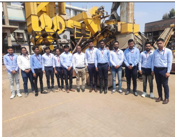
14. Industrial visit to Akashganga,Satara For B.Tech. mechanical engineering studnets