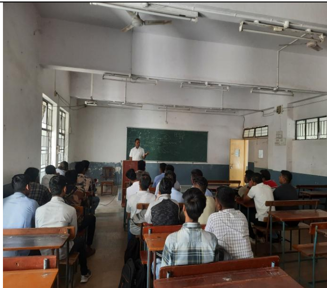
17. Session on" Importance of doing final year project"