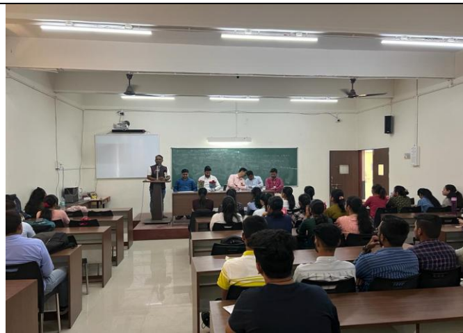
8. Addressing students on “ Inauguration