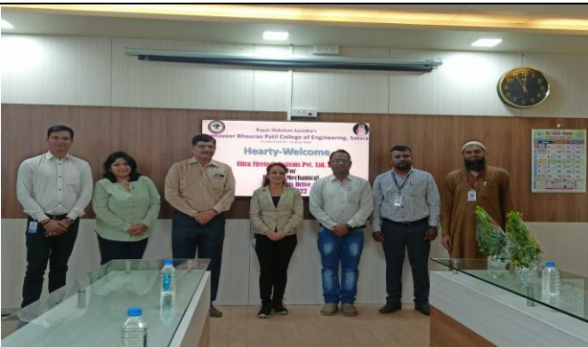
7. Campus Drive by Ultra Firetech,Pune