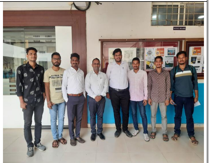
14. Off Campus Drive by Just Dial, Pune