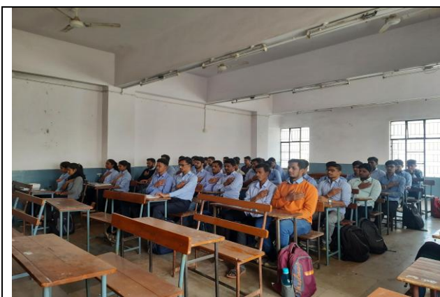
1.Session on "Importance of doing Meditation" For T.Y.&B.Tech.-Mechanical Students