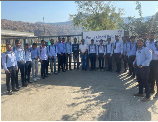
15. Industrial visit to Poshs Cinoti Pvt.Ltd., For B.Tech. mechanical engineering studnets