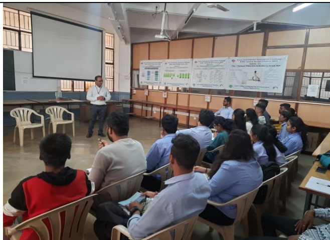
7. Session on “ Importance of doing Internship”