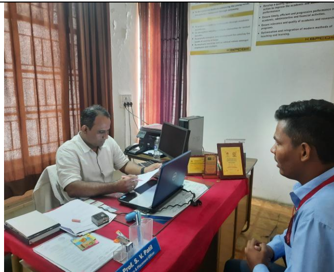
10. Mock Interviews conducted for B.Tech. mechanical engineering studnets