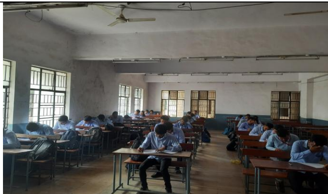
3. Campus Drive by Nichrome Inida Pvt.Ltd., Shirwal