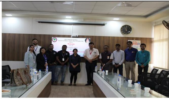
4. Campus Drive by QualityKiosk Technologies,Mumbai