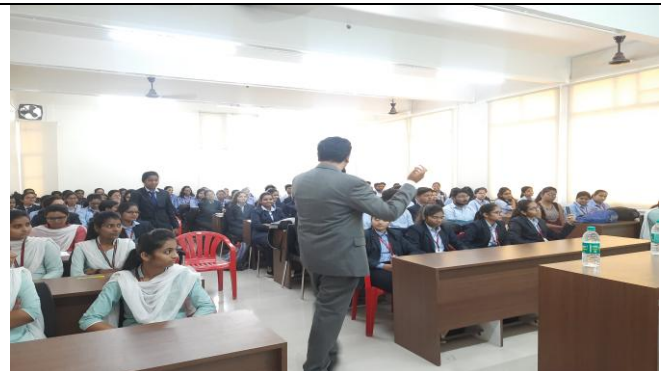
5. Campus Drive by Sankey Solutions