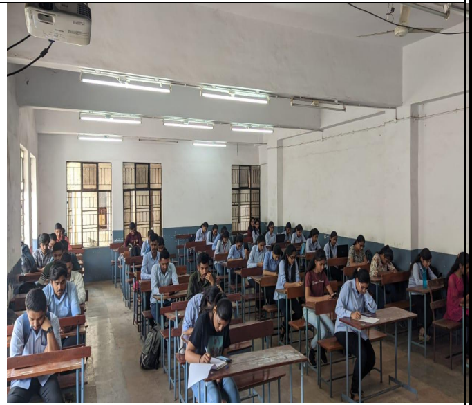
18. Condcuted Mock Aptitude Test for all B.Tech. Students