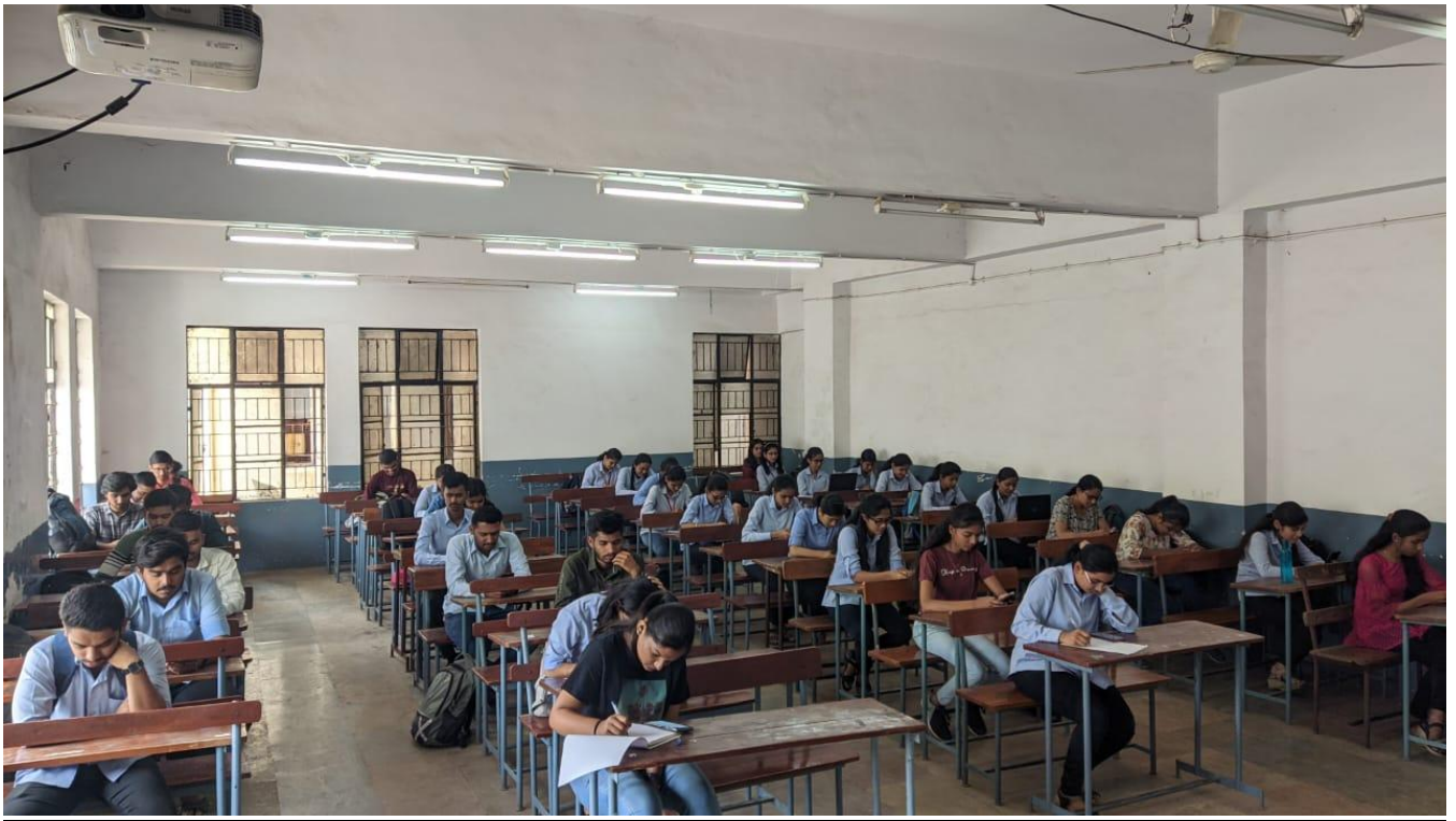
9. Session on “How to become successful Entrepreneur” For T.Y.-Engineering students by Swavalambi Bharat Abhiyan on 15.03.2023