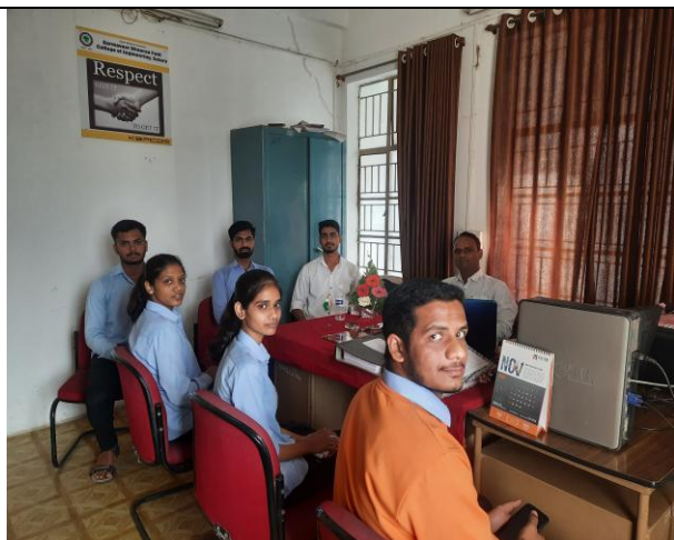
5. “Drive coordination” planning meeting with T.Y.-Mechanical Students