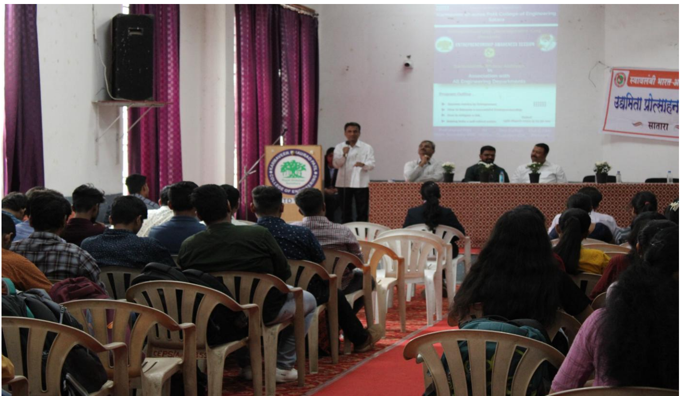
10. Programming idol Competition in association with MaTPO on 18.03.2023 ( MaTPO Programming Idol-2023)