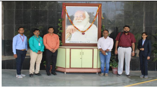
6. Campus Drive by Walchandnagar Industry