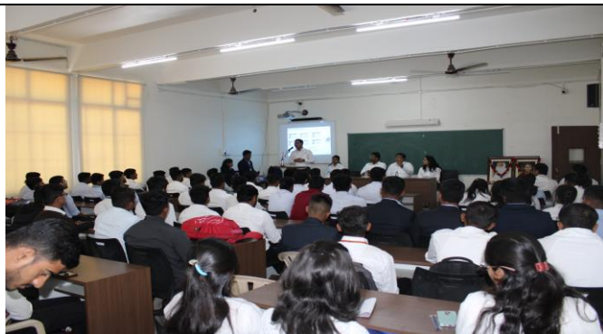
2. Campus Drive by KSB Limited