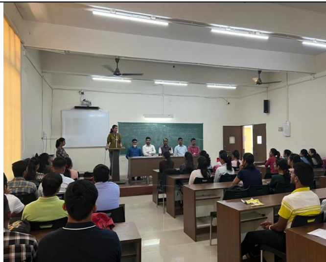
9. Session on “ Emerging Technologies for B.Tech. Students