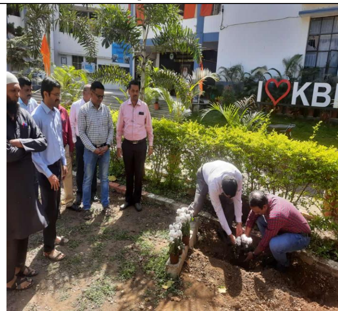
21. Tree plantation by Training & Placement Cell