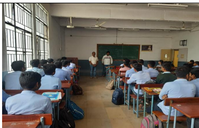
2."How to prepare for core and IT indcurties" For T.Y.&B.Tech.-E&TC Students