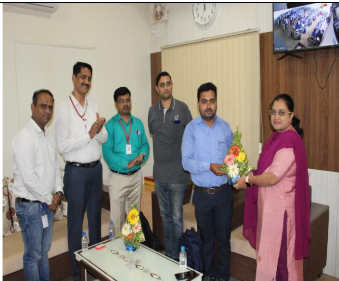
13. Off Campus Drive by Hi-Tech Engineers Pvt.Ltd., Shirwal