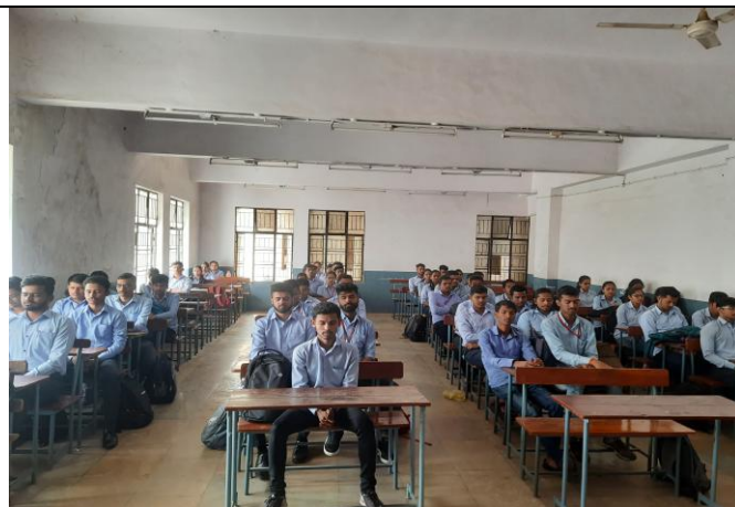
12. Dream for Dream Company