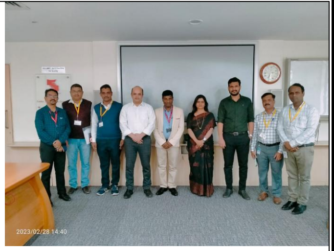
16. Attended corporate meet at Symbiosis Skill University,Pune